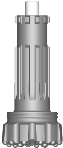
380 Bit Shank