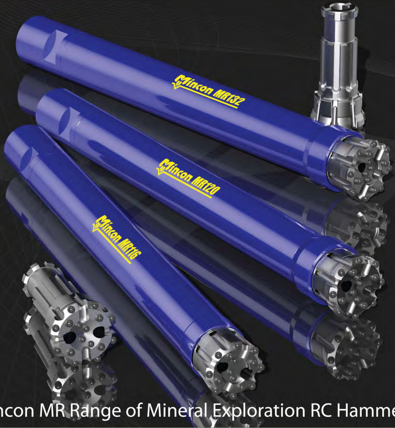
Mincon MR Range of Mineral Exploration RC Hammers