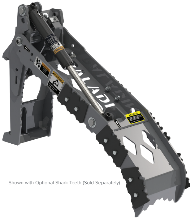
Shown with Optional Shark Teeth (Sold Separately)