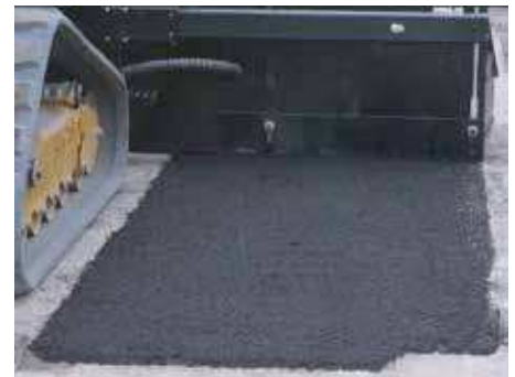
Adjustable mold board.