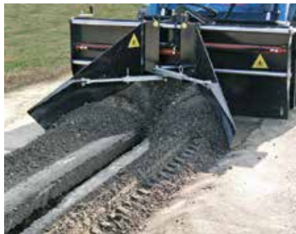
High speed and accuracy.

Designed without a limiting hopper. As soon as the asphalt is unloaded, the ST can spread it.